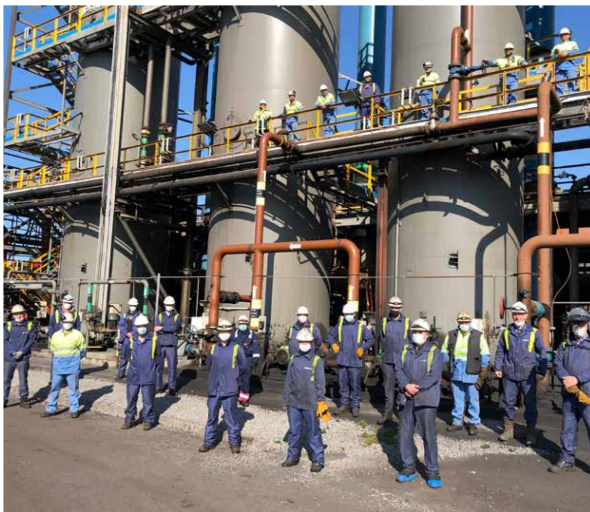
Morfa Coke Ovens shift celebrated the 1.5million push cycles in the same year as they reach their 40 year anniversary