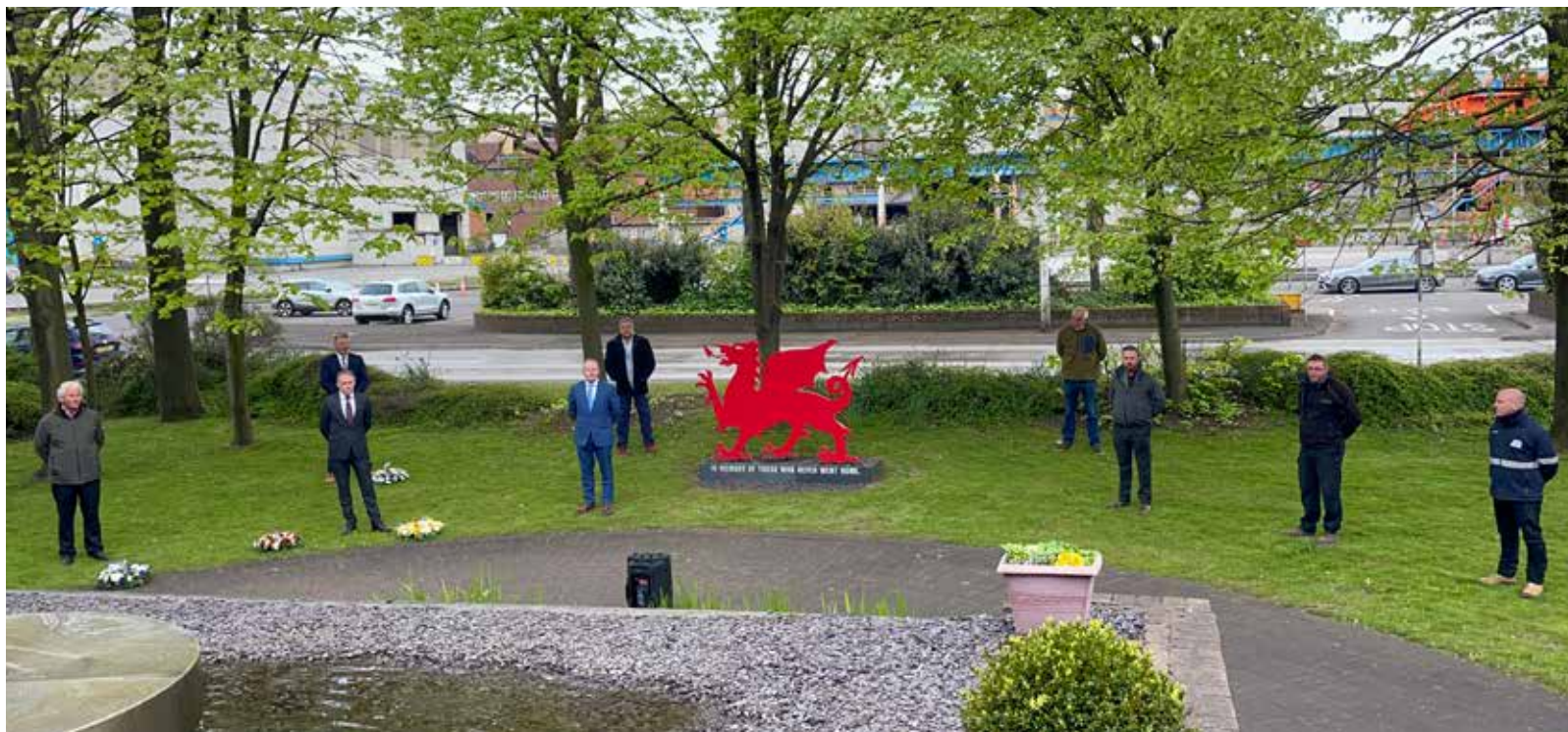
Employees, contractors, managers and Trades unions paused to remember all those who have been injured or lost their lives at work.