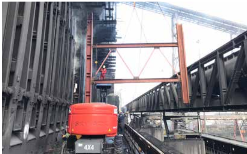
Buckstay's are support structures that are crucial to maintain oven integrity

Colleagues at CES have worked hard over 3 decades refurbishing caster segments - what an achievement