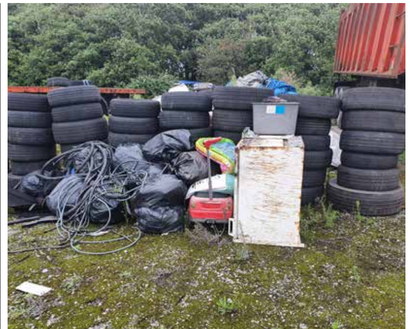
Some of the waste dumped at our unused Penrhyn entrance includes tyres, household waste and unfortunately drug paraphilia

I did my Master's degree in Environment Monitoring and Assessment at the University of Southampton. I joined the business as a graduate in September 2020. I originally joined to work with Group Environment as an Energy & Environmental Graduate. In February 2021, I was offered the position in the Strip UK Environment Team as Environment Engineer for Water. It's been a brilliant opportunity for myself, and I have already learnt so much.