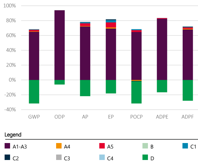
Figure 4 LCA results for the cladding system

Module D values are largely derived using worldsteel's value of scrap methodology which is based upon many steel plants worldwide, including both BF/BOF and EAF steel production routes. At end-of-life, the recovered steel cladding is modelled with a credit given as if it were re-melted in an Electric Arc Furnace and substituted by the same amount of steel produced in a Blast Furnace [24] . This contributes a significant reduction to most of the environmental impact category results, with the specific emissions that represent the burden in A1-A3, essentially the same as those responsible for the impact reductions in Module D.