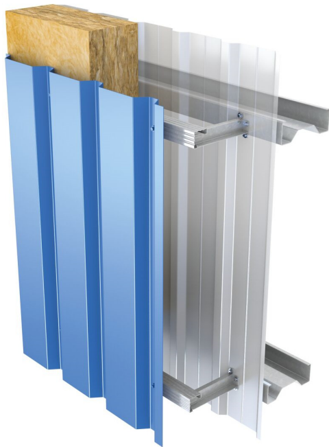
Figure 1 Trisobuild® built-up vertical wall system

Trisobuild® built-up vertical wall systems comprise of a Colorcoat® pre-finished steel trapezoidal liner profile, a spacer system, an insulation layer and a Colorcoat® pre-finished steel external weathering profile (see Figure 1). The Trisobuild® systems incorporate a range of Tata Steel profiles and a package of Platinum® Plus pre-approved, reputable high-end components that provide tested solutions from both roof and wall constructions together with solutions for fire resistance and acoustic reduction and absorption. Our dedicated and experienced building envelope technical team are available to help develop a specification for your project and assist with project specific advice to ensure that all design aspects of the chosen cladding system meet your project requirements. The wool insulation is classified as A1 to EN 13501-1 [8] and the Trisobuild® system is approved by the Loss Prevention Certification Board (LPCB) [9].